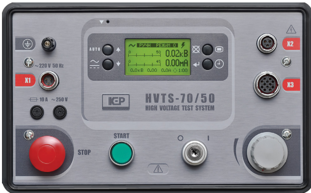
HVTS-70/50 control panel