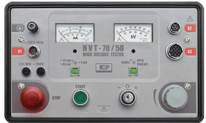
HVT-70/50 control panel